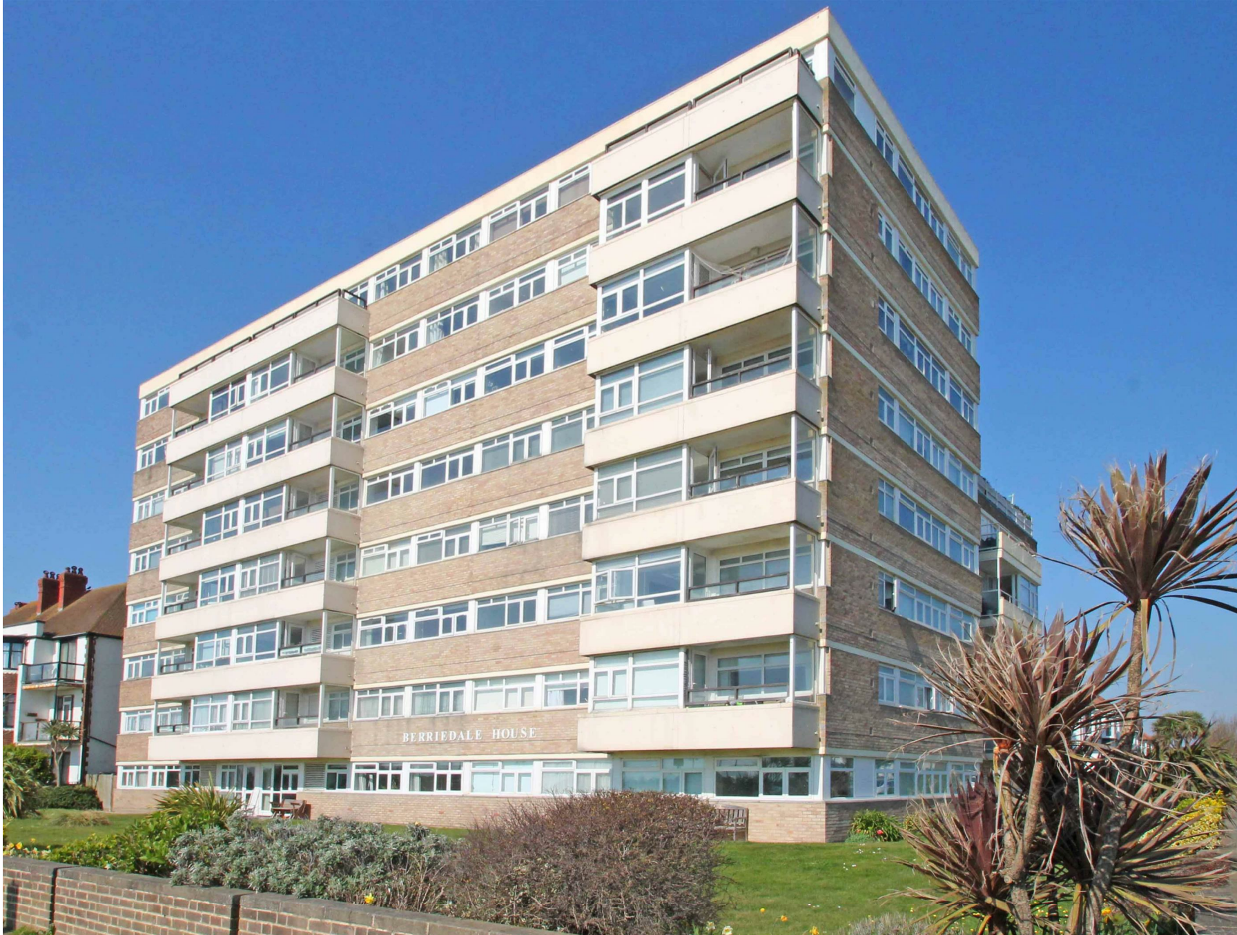
Berriedale House, Kingsway, Hove, BN3 4HD £230,000